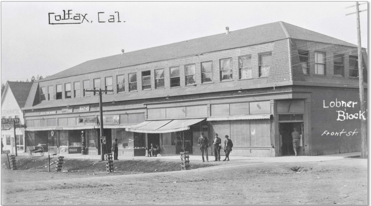
The Lobner Block, Colfax, California, 1900. This was located on Front Street, which is now Main Street.